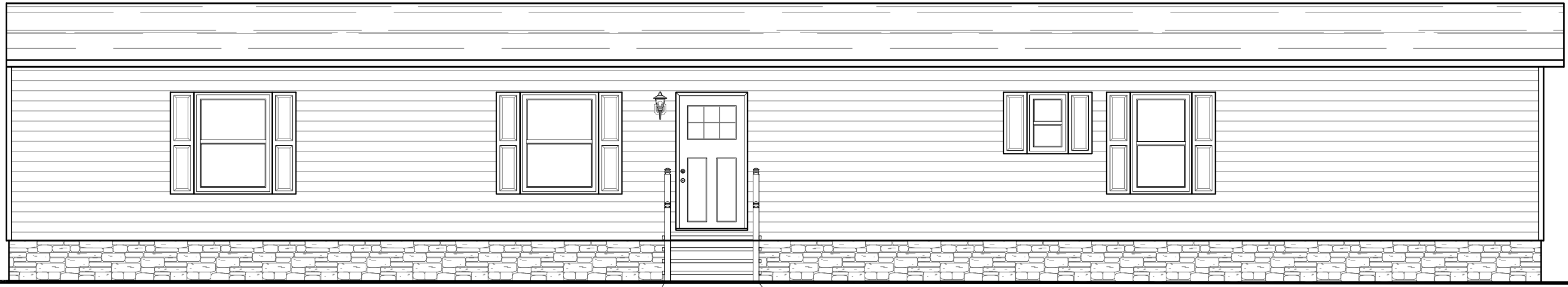
VINYL LAP EXTERIOR ELEVATION